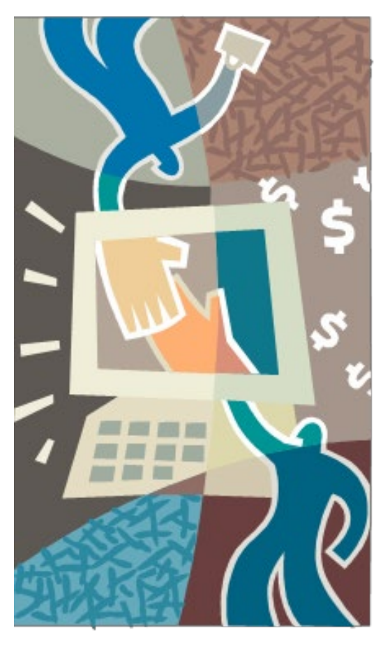
SECTION 2 SUSTAINABILITY MEASURES

Rev 2023.06 Date: rev June 23, 2023 14 | Page