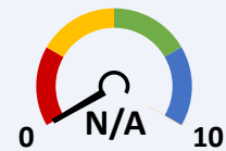
NSPF SCORE VS. COMPARISON DISTRICT (10 POINTS)