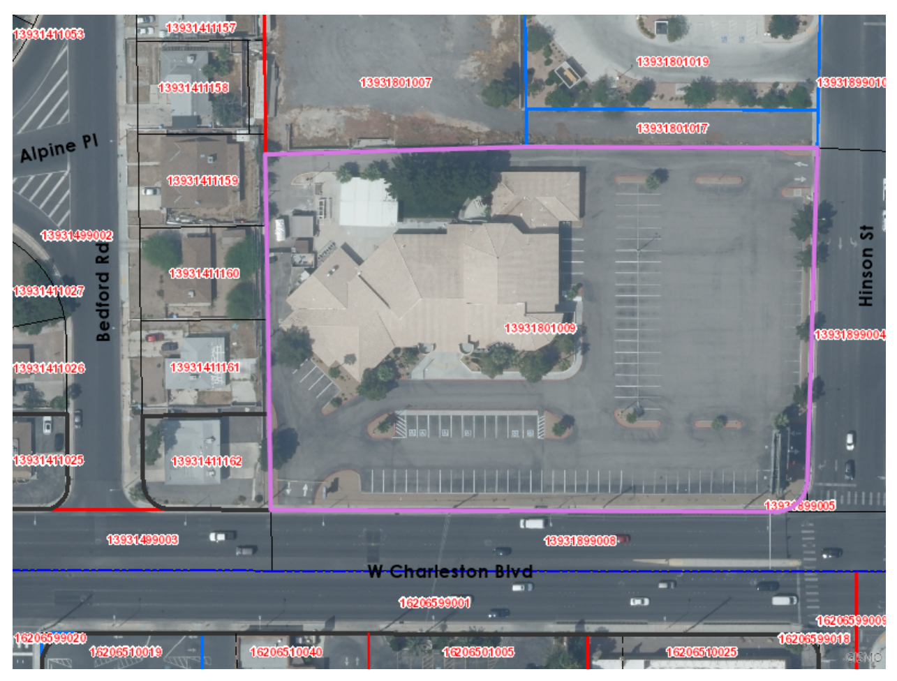
The MAPS and DATA are provided without warranty of any kind, expressed or implied. Date Created: 08/04/2021