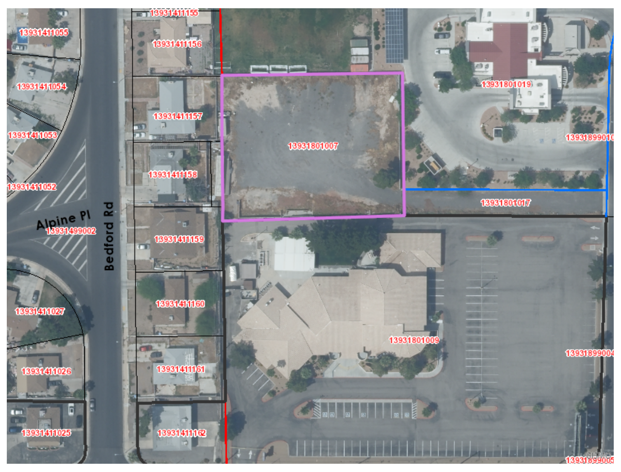
The MAPS and DATA are provided without warranty of any kind, expressed or implied. Date Created: 08/04/2021