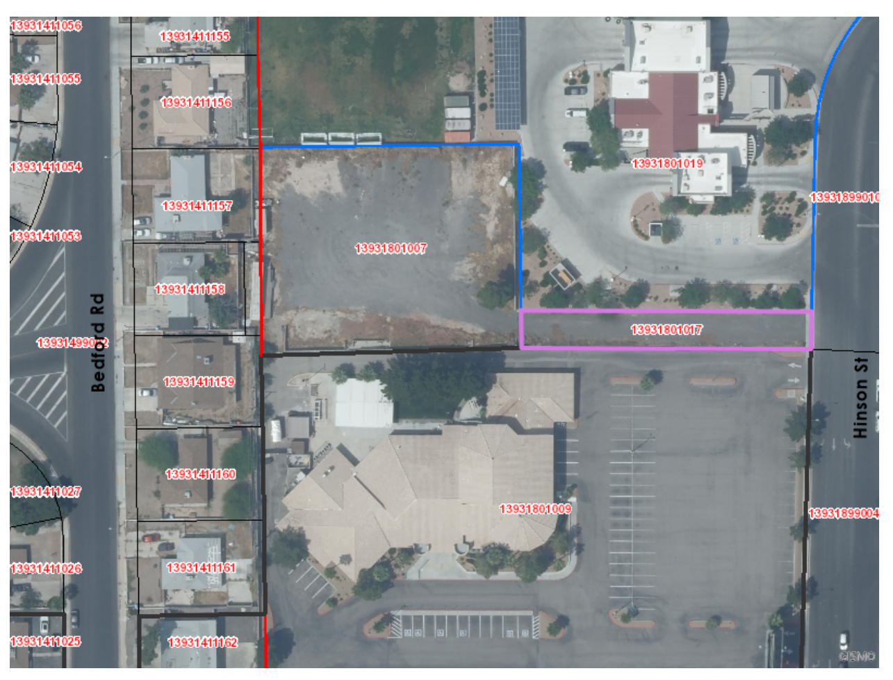
The MAPS and DATA are provided without warranty of any kind, expressed or implied. Date Created: 08/04/2021